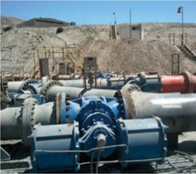
Large diameter DeZURIK PEC Valves in a tailings application