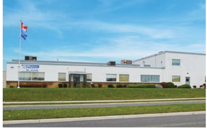
DeZURIK Cambridge, Ontario, Canada Established in 1961, 50,000 sq. ft.