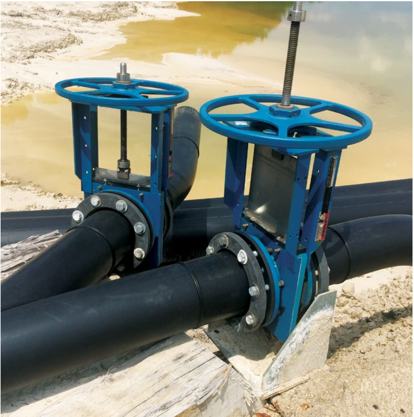
Two DeZURIK 8" KSL Slurry Knife Gate Valves installed on a gypsum discharge service.