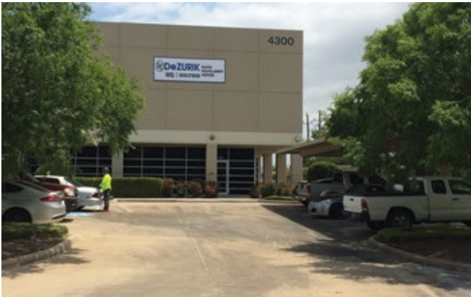
Rapid Fulfillment Center, Houston, TX, USA Established in 2018, 43,000 sq. ft.