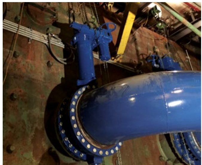
DeZURIK AWWA Butterfly Valves with neck extensions and electric motor actuators isolate water to the condenser.

Throughout our 250 years of combined history, DeZURIK, APCO, and HILTON have been recognized worldwide for collaborating with customers to design and engineer valves that provide superior performance and value. Each company was founded by an innovator who set out to solve a customer's problem application. Today, the DeZURIK, APCO, and HILTON brands continue the tradition of partnering with our customers in the power industry to provide the newest innovations in gate, plug, butterfly, check, air and rotary control valves.