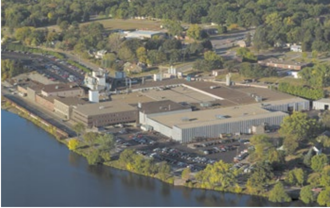
DeZURIK Corporate Headquarters and Manufacturing Facility, Sartell, MN USA Established in 1928, 420,000 sq. ft.