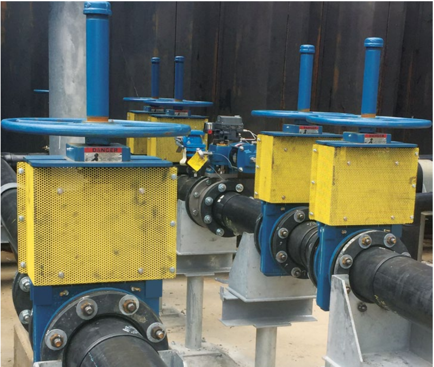
DeZURIK KSL Slurry Knife Gate Valves equipped with optional gate guards on a FGD return water system.