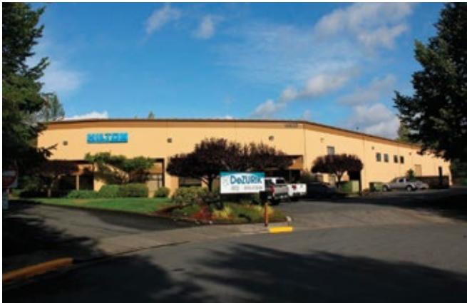
DeZURIK, Redmond, WA, USA. Established in 1952, 25,000 sq. ft.