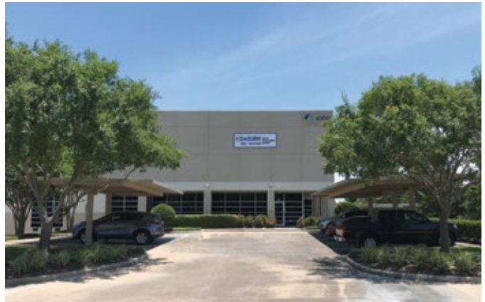
DeZURIK Houston Rapid Fulfillment Center, Houston, TX, USA. Established in 2018, 42,000 sq. ft.