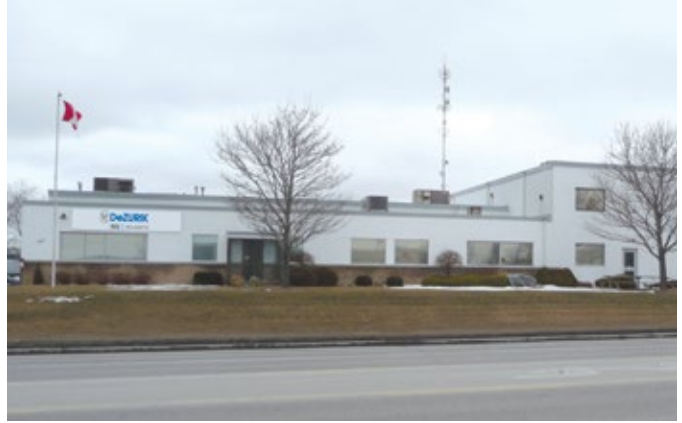
DeZURIK Cambridge, Ontario, Canada. Established in 1961, 50,000 sq. ft.