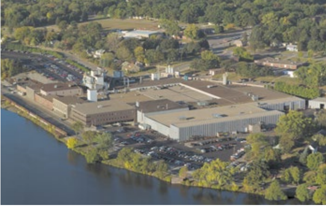
DeZURIK Corporate Headquarters and Manufacturing facility, Sartell, MN USA. Established in 1928, 420,000 sq. ft.