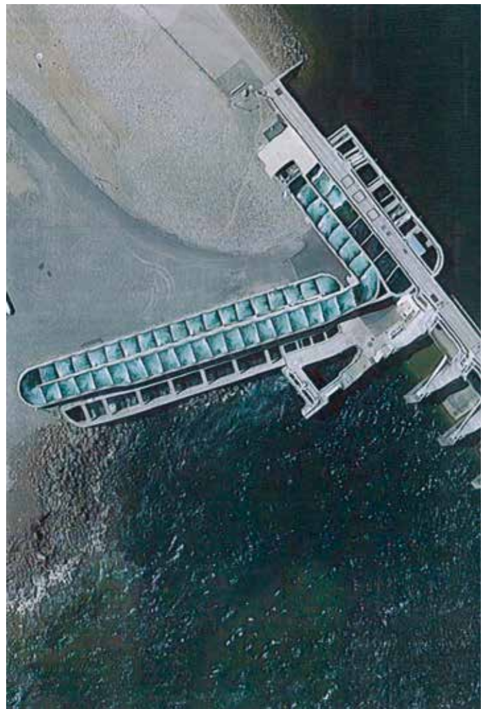
An aerial view of the fish ladder and the attraction pool. The water supply for the attraction pool is controlled with a 66" DeZURIK Eccentric Plug Valve.

The DeZURIK Eccentric Plug Valve was found to be an ideal control valve choice due to the high velocity and potential cavitation in this application. The maximum velocity at high flow was 38 feet / second with head pressure of 50 psi. Because the eccentric plug valve features low dynamic torque and cavitation resistance, it could handle the velocity of the pipeline. A butterfly valve was considered for the valve application, but was rejected due to the high velocity. All other valve designs the engineers flow modeled required much more costly piping design to accommodate the high velocity and pressure drop.