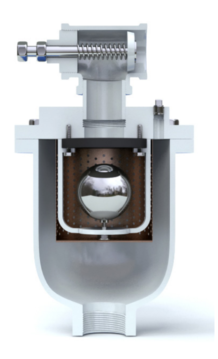
AVV Air/Vacuum Valve with Double Acting Throttling Device (DAT) and Water Diffuser (WD)