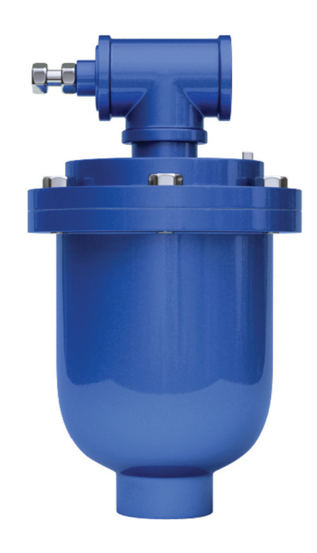
AVV Air/Vacuum Valve with Double Acting Throttling Device (DAT)

APCO Water Diffusers perform much like water faucet strainers, breaking down the solid water column force into a smooth, non-destructive flow. Water Diffusers (WD) are available in 0.5-3" (15-80mm) sizes.