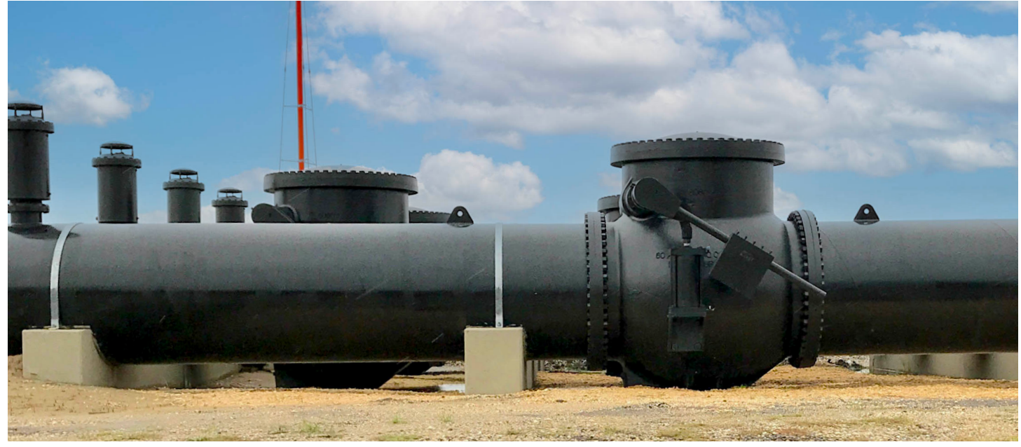
Four 60" APCO CVS Swing Check Valves and ASV Air Vacuum valves are part of a pump station that directs stormwater away from the Louis Armstrong New Orleans Airport to protect against flooding damage during tropical storms.

APCO CVS-6000 Swing Check Valves are a heavily constructed, full waterway flow area, premium design with multiple features. They can be used on clean or dirty media, and are designed to handle high flow rates, pressures and withstand shock. They are available in sizes 2-66" (50-1700mm), can be rated up to 640 psi CWP (4410 kPa) and are available with ANSI Class 125/150 or Class 250/300 flanges. Constructed with a heavy ductile iron body. Closure control devices include Air Cushioned Cylinder, Oil Controlled Cylinder, Bottom Mounted Buffer, Lever & Spring and Lever & Weight.