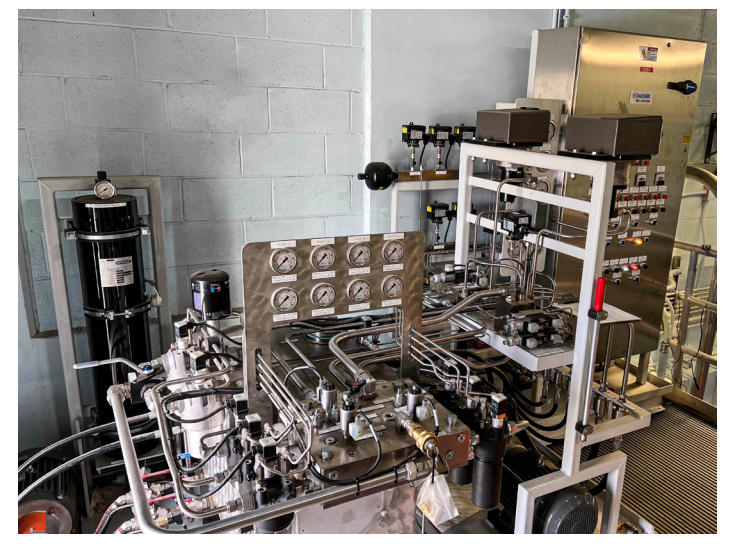
Hilton Hydraulic Power Unit (HPU) located in the control house outside the dam.