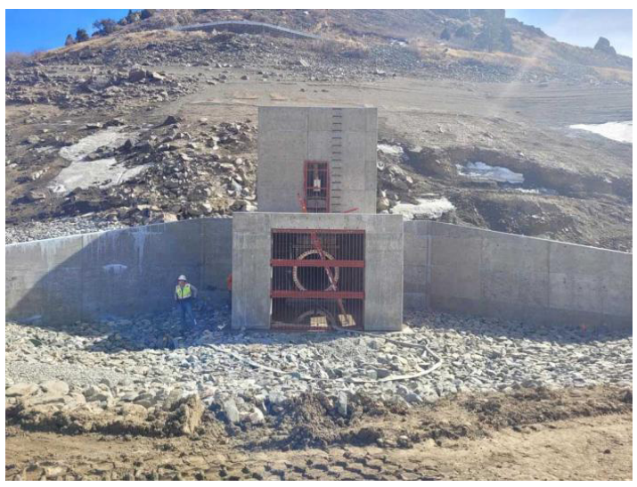
The 66" Hilton Knife Gate Valve in the vault at the bottom of the drained reservoir.