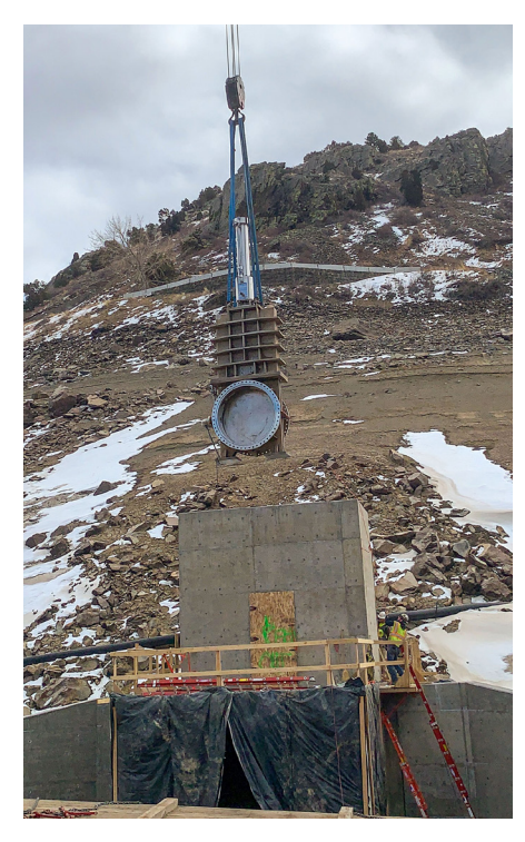
A crane lowers the 66" Hilton Knife Gate Valve down into the vault at the bottom of the reservoir

DeZURIK was proud to provide a complete system solution that included valves, the HPU and the control system. Combined and tested together, these are ready to perform reliably for the next 100 years.