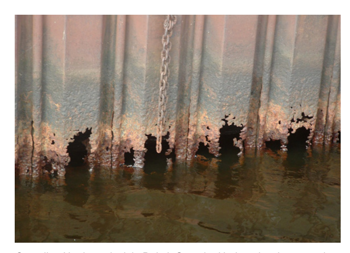
Canadian Northern dock in Duluth Superior Harbor showing corrosion of freshwater MIC

There are options to treat MIC susceptible valves and pipelines such as applying biocides to kill the bacteria in the water or pigging which removes the biofilms with a mechanical cleaning tool. There's also been recent research in specialized enzymes that are added to metal coatings that reduces the amount of biofilm produced. The best way to address MIC concerns is by choosing the best materials to handle the process environment. Field experience and lab testing indicate 300 series austenitic stainless steels and duplex austenitic-ferritic stainless steels are susceptible to