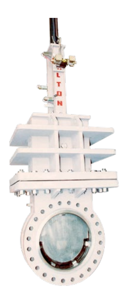
24" Bonneted Knife Gate, 800 psi, Inconel 625 Trim, Coal Processing, Wyoming