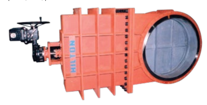
48" Wedge Gate Carbon Steel Body, Monel Trim, Belzona Interior Coating, Narrow F to F, Shipboard Seawater Cooling