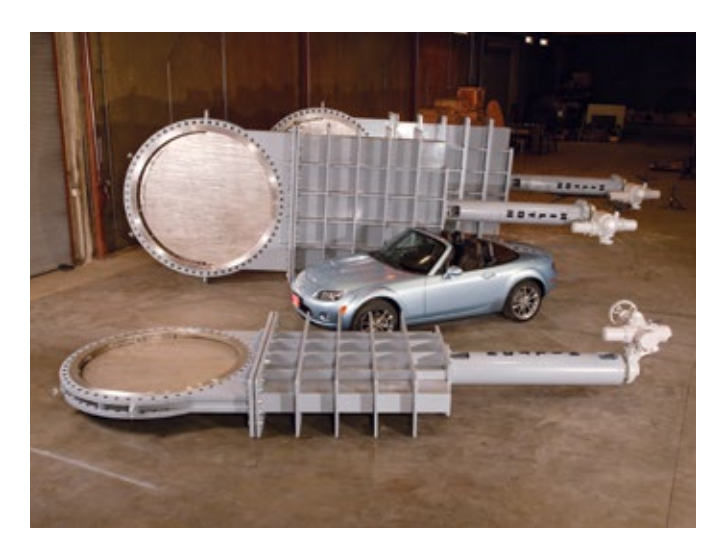
84" & 66" Bonneted Knife Gates, CS Flanges, 304 SS Trim, Electric Motor Actuators. Wastewater Plant, Dallas

Plate material is readily available in all alloys to avoid foundry and casting delays to improve responsiveness and reduce delivery time. On severe service applications where valve wear surfaces require periodic refurbishing, fabricated plate construction is more easily repaired than cast valves resulting in quicker turnaround and reduced maintenance cost.