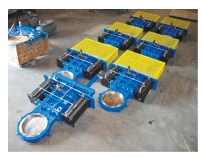
18" Bonnetless Knife Gates, 150 psi, 316 SS Trim, Expanded Metal Safety Guard, Hazardous Waste Disposal, Ohio