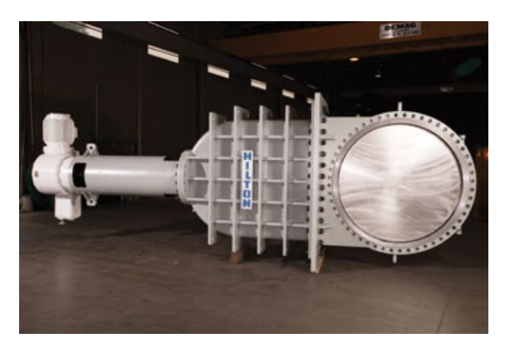
60" Bonneted Knife Gate, 275 psi, Carbon Steel, 304 SS Trim, Epoxy Interior, Chicago Deep Tunnel System