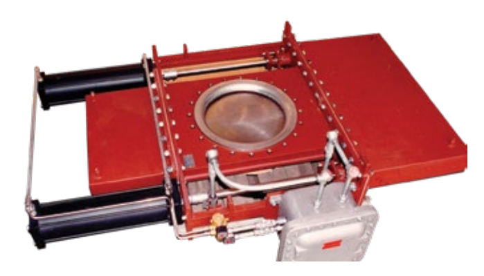
20" Thru-Port Valve, Double Bonneted, Dual-Side Mounted Cylinders to Reduce Length, Dry Solids Gravity Flow