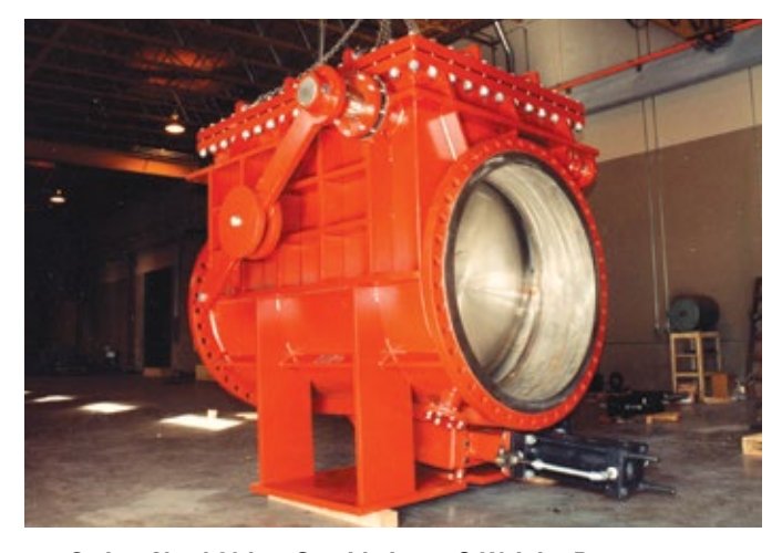
54" Swing Check Valve, Outside Lever & Weight, Bottom Hydraulic Dampener. Wastewater Treatment Plant, Taiwan