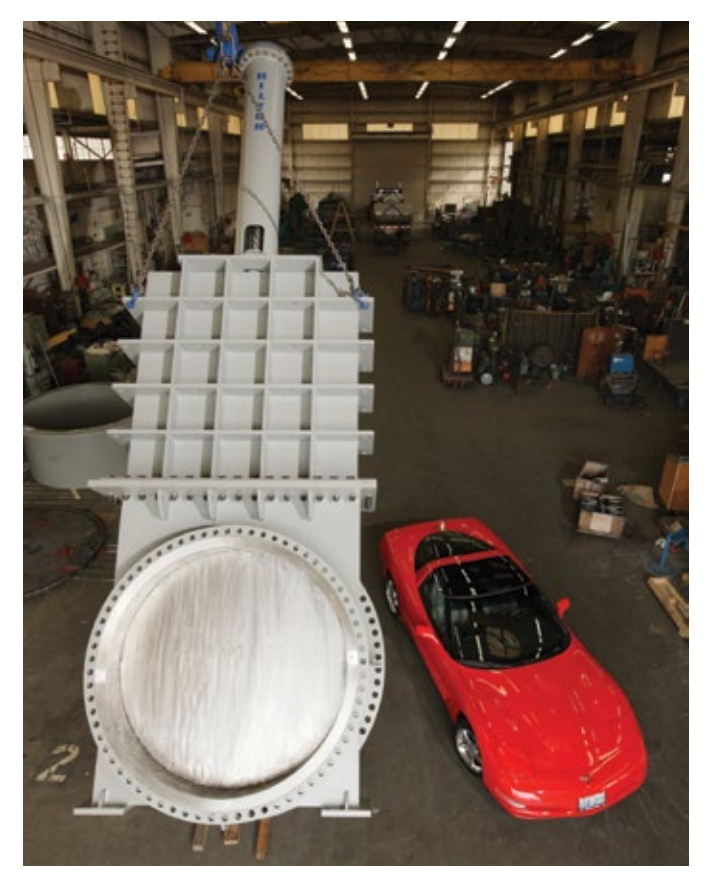
90" Inlet x 102" Outlet Throttling Knife Gate, 30 psi, PG &E Pitt River Dam, Northern California