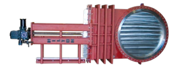
60" Bonnetless Knife Gate, Resilient Seat, Extended F to F, Gate Guide, GE Plastics Southern Indiana