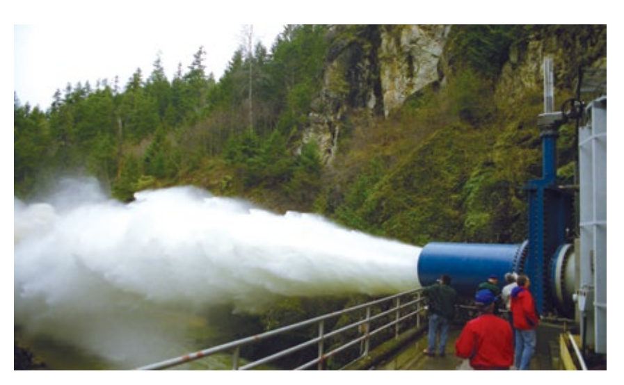
42" Jet Flow Gate, Head 800 Feet, La Grand Dam, Tacoma, WA

Specially designed for high velocity flow regulation on high-head dams and reservoirs. Jet Flow Gates provide precise, full range throttling from full open down to full closed. Split body design available with stainless steel trim and epoxy internal coating or with all stainless wetted parts, both with bronze gate guides and bronze seat ring. All components are fully machined for precise alignment. Anti-cavitation features include a tapered seat ring to direct flow inward and a downstream port larger than the orifice port to provide sufficient air flow. Based on original U.S. Bureau of Reclamation design. Sizes 6" to 96" (150 to 2500mm), pressures to 400 psi (2760 kPa).