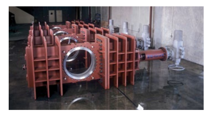
40" Thru-Port Knife Gates, ASME 300, Removable Port Liners, Tungsten Carbide Hardfacing & Abrasion Resistant 410 SS Gate, Abrasive Mine Tailings, Kennecott Copper, Utah