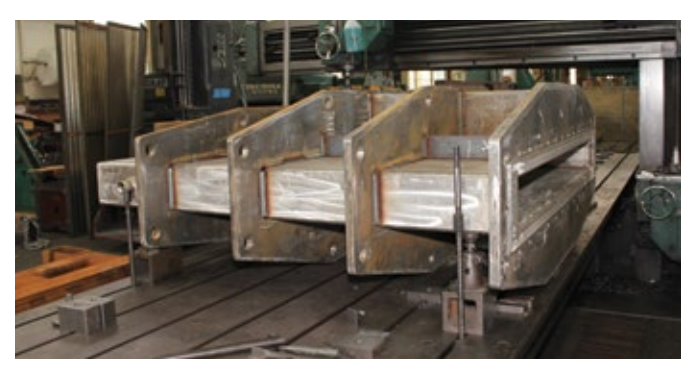
In-House Machining, 72" Bonneted Knife Gate Valve