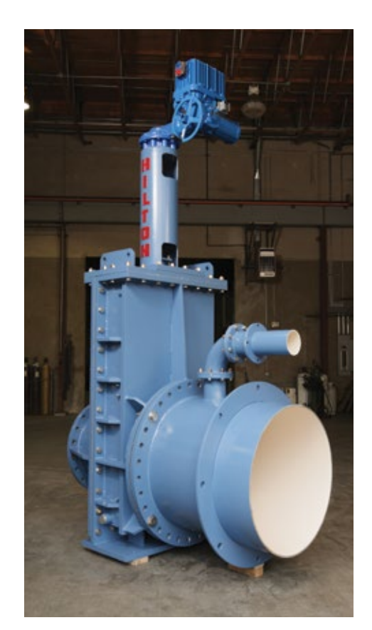
Jet Flow Gate, 24" Inlet, 38" Outlet, 150 psi, CS with 304 SS Trim, Big Tujunga Dam, Los Angeles County