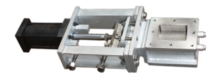
Bonnetless Knife Gate, 150 psi, 304L SS, Extended F-to-F, Purge Ports, Pneumatic, Co-Gen Plant Wood Chip Processing