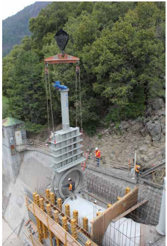
A Hilton Throttling Knife Gate Valve is installed at a California dam project.

Additionally, with a standard knife gate valve, the discharge flange is the same size as the inlet flange, which will not allow sufficient airflow to enter the discharge side of the valve to prevent cavitation.