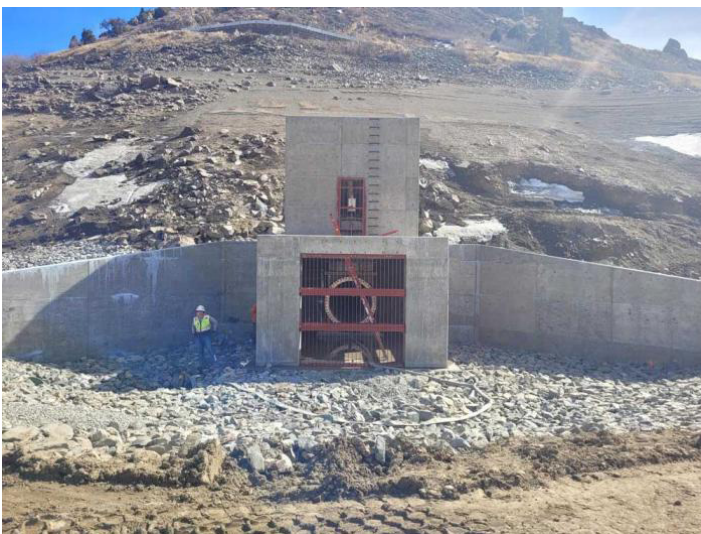
The 66" Hilton Knife Gate Valve in the vault at the bottom of the drained reservoir.