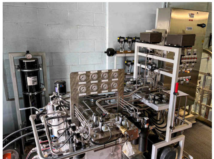
Hilton Hydraulic Power Unit (HPU) located in the control house outside the dam.