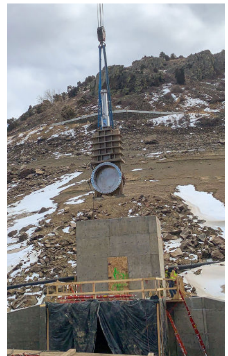
A crane lowers the 66" Hilton Knife Gate Valve down into the vault at the bottom of the reservoir.

DeZURIK was proud to provide a complete system solution that included valves, the HPU and the control system. Combined and tested together, these are ready to perform reliably for the next 100 years.