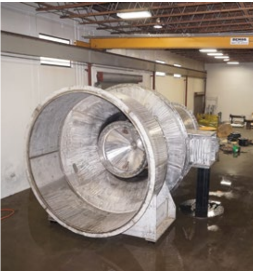
A Hilton fabricated 60" Fixed Cone Valve with installed hood, prepared to ship to a dam in the United States.