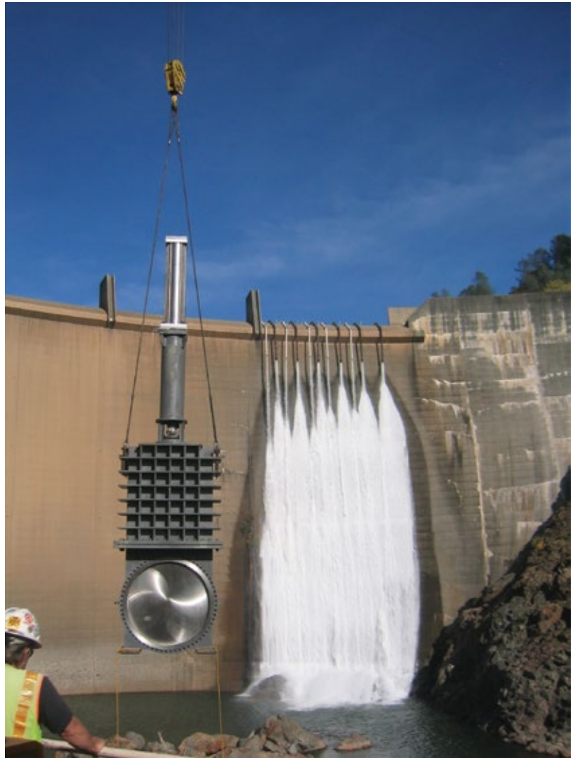
A 72" Hilton Bonneted Knife Gate Valve (130 psi rating) with hydraulic cylinder actuator is used for a guard valve for a Fixed Cone Valve at a dam in northern California.

DeZURIK's dedication to outstanding practices is ingrained in its culture, and exemplified in our quality system. DeZURIK has been certified to the ISO 9001 standard since 1996. To further demonstrate our confidence in our product quality, DeZURIK offers a 2-Year Manufacturer's Standard Warranty – double the length of time offered by most other manufacturers.