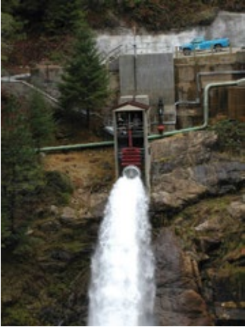
A 48"/60" Hilton Throttling Knife Gate Valve (50 psi rating) with electric motor operator is installed on a flow modification project.

The application expertise of DeZURIK technical sales representatives, located throughout the world, will ensure you receive the personalized and complete service you need to keep your process performing at optimum levels. Our independent representatives are backed by over 500 DeZURIK employees at our factories, service centers and offices whose primary goal is customer satisfaction and maintaining long-term relationships.