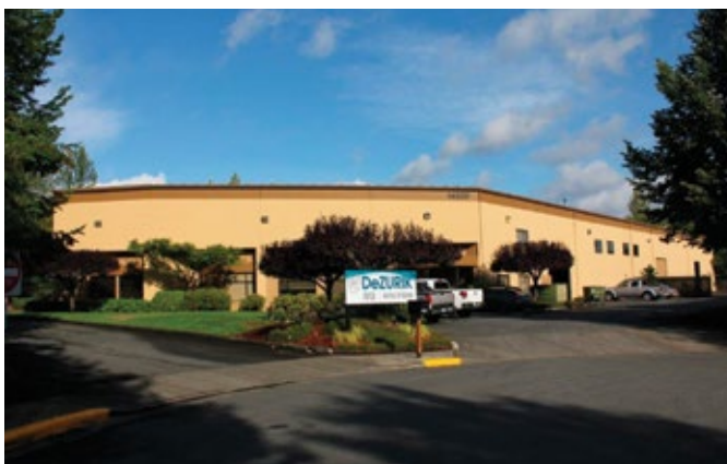
DeZURIK, Redmond, WA, USA Established in 1952, 25,000 sq. ft.