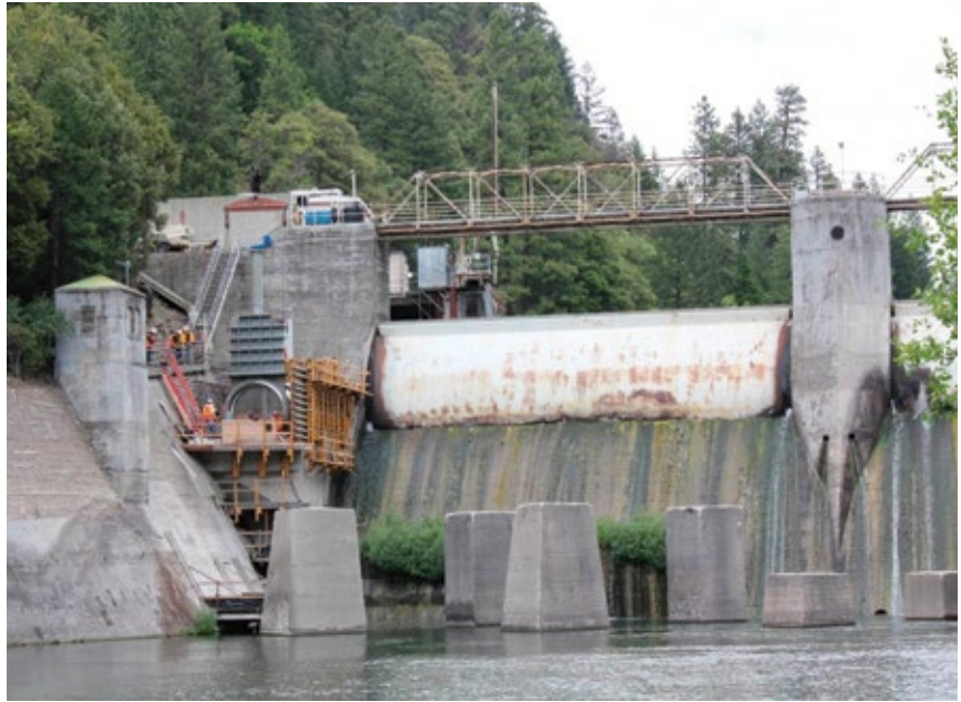
A 90"/102" Hilton Throttling Knife Gate Valve (30 psi rating) is installed on the Pit River in Northern California.

Today, the DeZURIK, APCO, HILTON and Willamette brands continue the tradition of partnering with our customers in the hydropower industry to provide the newest innovations in gate, plug, butterfly, check, air, ball, cone and rotary control valves, and hydro-specific products such as jet flow gates, fixed cone valves, and throttling knife gate valves.