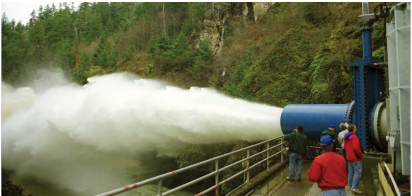
This 42" Hilton Jet Flow Gate is installed at LaGrande Dam near Tacoma, Washington.