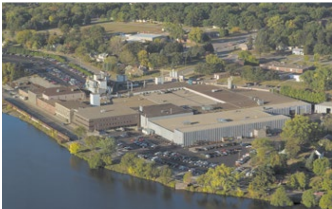
DeZURIK Corporate Headquarters and Manufacturing Facility, Sartell, MN USA Established in 1928, 420,000 sq. ft.