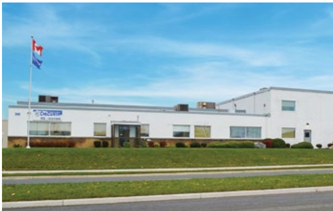
DeZURIK Cambridge, Ontario, Canada Established in 1961, 50,000 sq. ft.