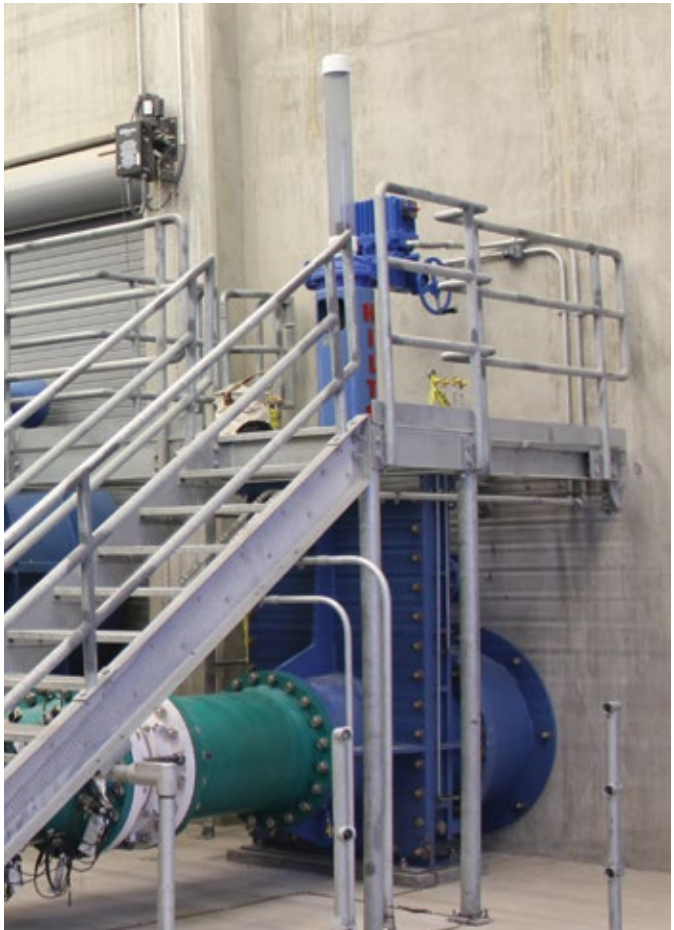
A Hilton 24" Jet Flow Gate (150 psig rating) with motor operator on a dam in Southern California.

DeZURIK engineers spend many hours in the field listening to customers so that they fully understand the intricacies of each application and incorporate that knowledge into each valve design. Using advanced tools such as Solid Modeling, Finite Element Analysis, 3D Rapid Prototyping and Computational Fluid Dynamics, DeZURIK engineers create valves that offer superior installed performance in some of the toughest applications in the hydropower industry.