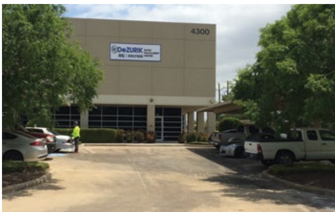
Rapid Fulfillment Center, Houston, TX, USA Established in 2018, 43,000 sq. ft.